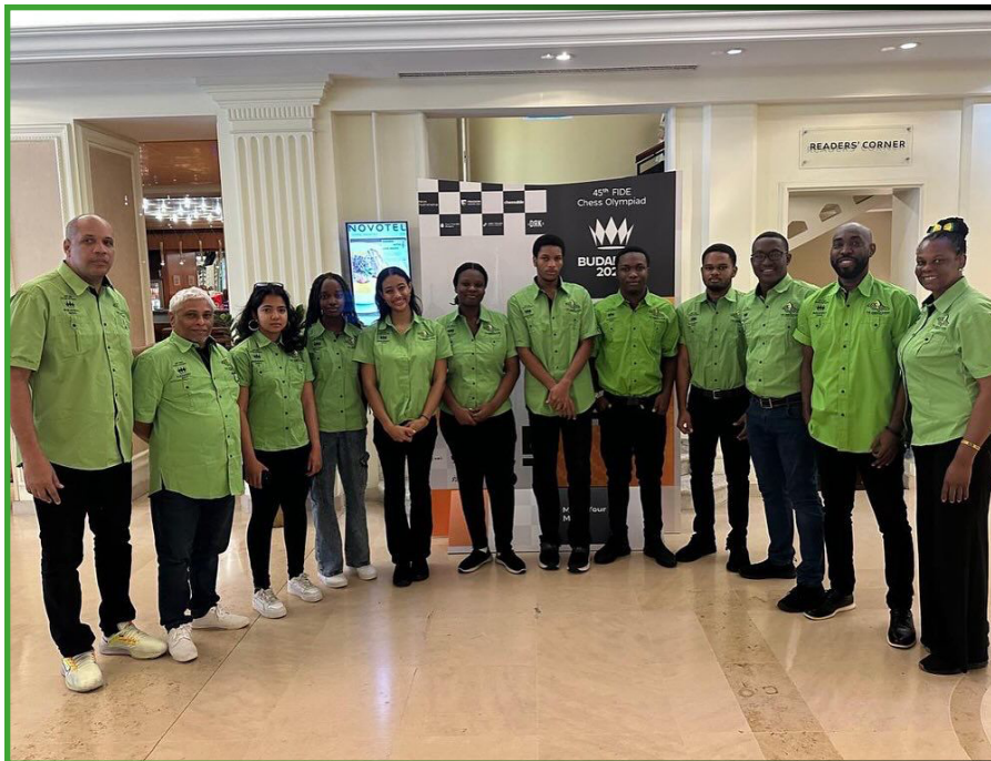
Team Jamaica in Budapest, Hungary

A fter 11 grueling rounds of play at the 45th Chess Olympiad held in Budapest, Hungary, (September 10-23), Jamaica's Open and Women's teams finished atop their respective Zones.